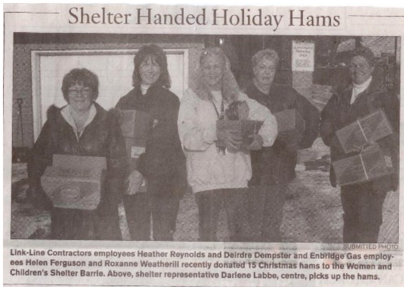
Link-Line and Enbridge donate 15 hams for the holiday season to the Women & Children's shelter of Barrie