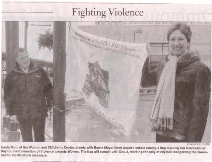
Marking International Day for the Elimination of Violence towards Women