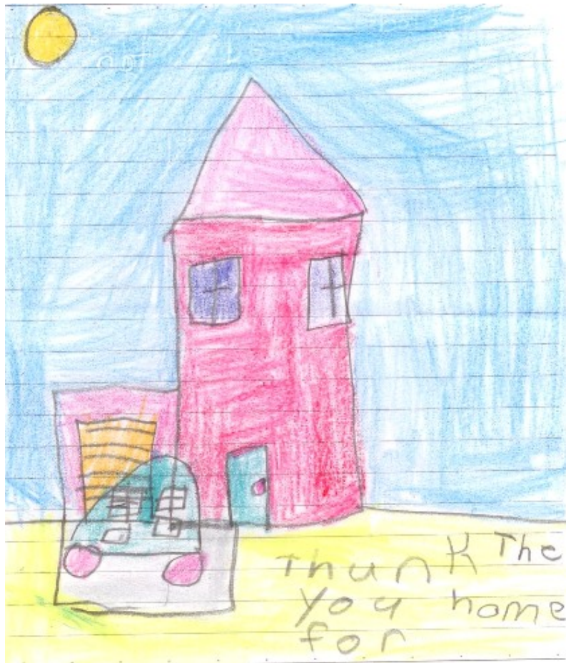
Drawn by a 15 year old girl